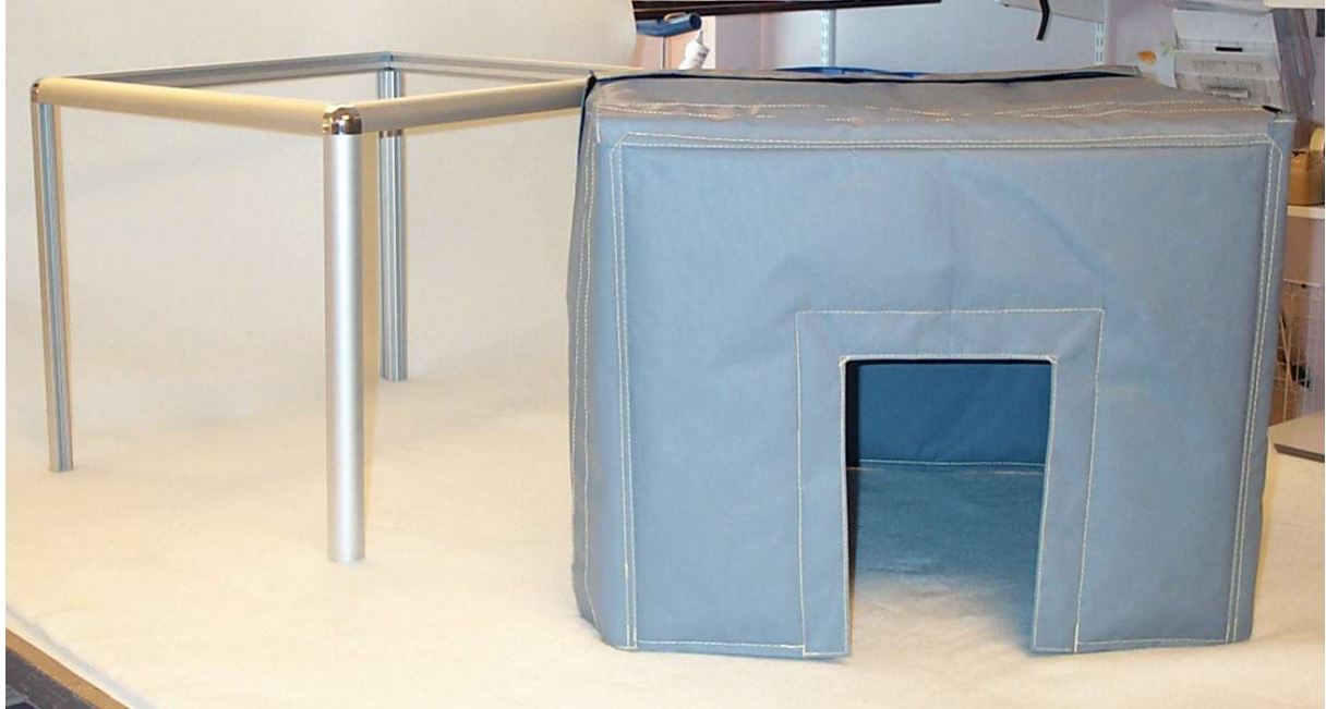
As an additional accessory, the tent can be supplied with a supporting frame, made of rounded Al-profiles

HEMI HEATING AB P.O. BOX 2077, S-151 02 SÖDERTÄLJE-SWEDEN