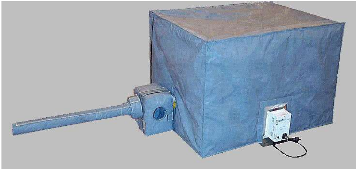
Bakeout tent assembled together with loadlock, transfer arm heating jacket and TecTra Bakeout heater fan.