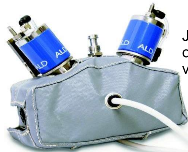
Jacket mounted on a ALD 3-way valve