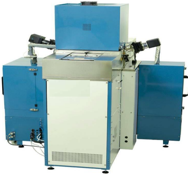
ALD-tool, equipped with Hemi Heating Jackets

- Gasline tubings – valves – manifolds – bubblers -