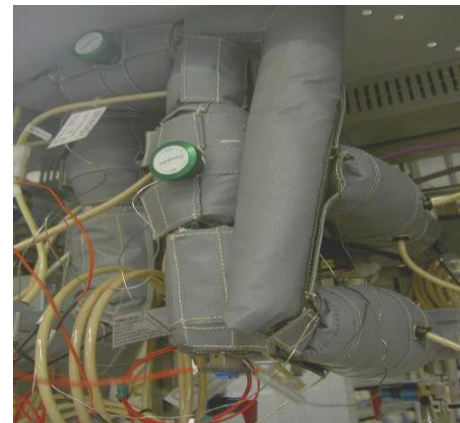
Heated gas stick for precursor supply